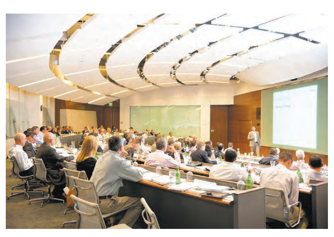
More than 100 advisors came to Dimensional's Austin, Texas, headquarters for two days of seminars.

Advisors selling DFA funds have monthly or quarterly meetings with one another, facilitated by a DFA manager, to discuss portfolio and practice manage-